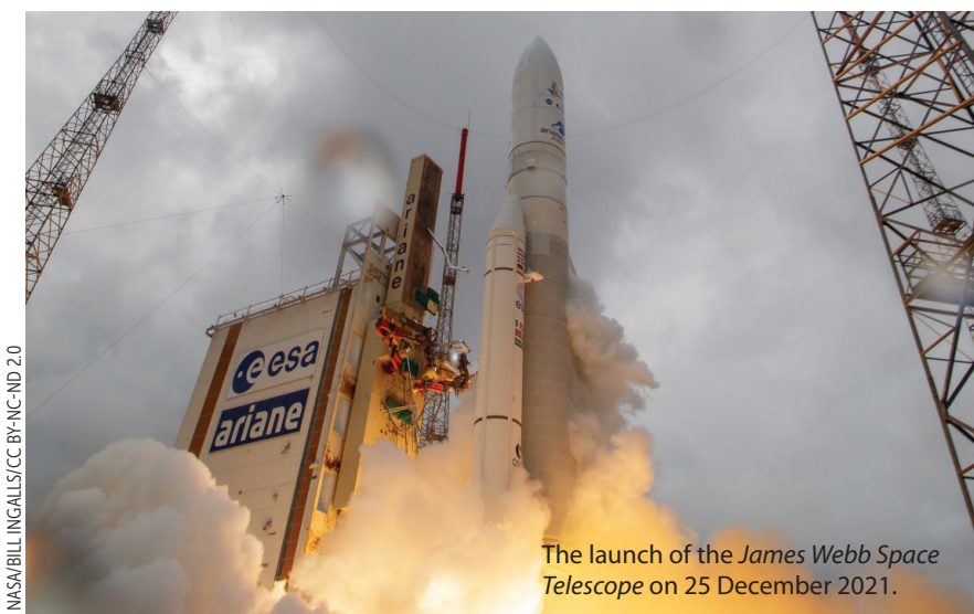
The launch of the James Webb Space Telescope on 25 December 2021.