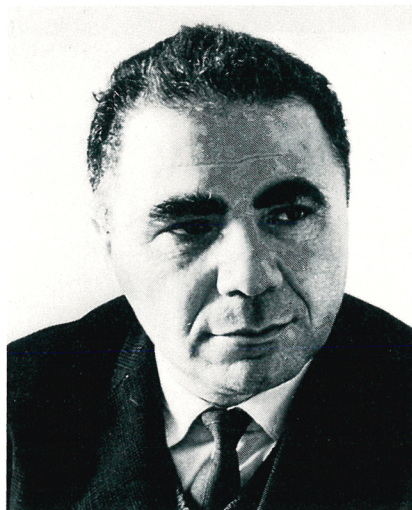
VICTOR AMAZASP AMBARTSUMIAN