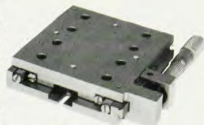
20.127 Translation Stage

New translation stages use a dual roller bearing system to achieve the smoothest shake-free motion available in a mechanical assembly.