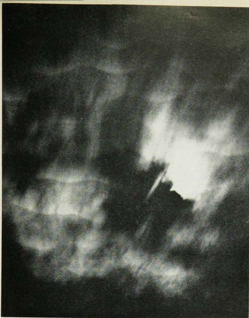
Photographic interpretation by J. Frederick Laval

Capability of detecting clandestine nuclear explosions is the aim of Project Vela. Los Alamos Scientific Laboratory is developing sensitive detection instrumentation to discriminate between natural radiation phenomena and those resulting from man-made devices detonated in space.