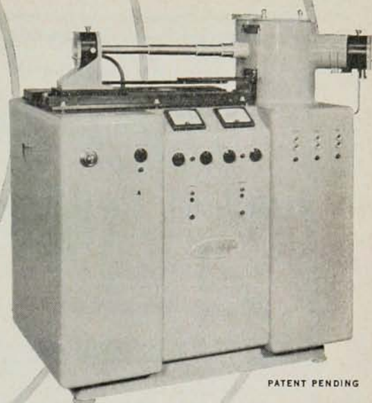
MODEL 255 TWO METER GRAZING INCIDENCE VACUUM U.V. SCANNING MONOCHROMATOR

Complete specifications and descriptive material available on request.